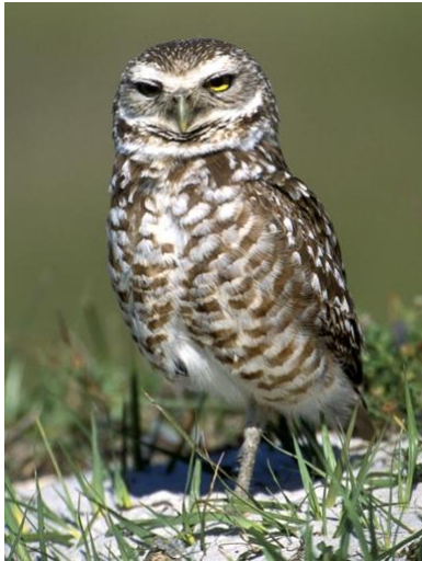
Burrowing Owl.

Burrowing Owls ( Athene cunicularia ) are generally associated with dry, open, short-grass, treeless plains. In the southwest, they occur in semi-desert or salt-desert habitats that may also include four-wing saltbush, rabbitbrush, and sagebrush. Burrowing owls rarely dig their own burrows; thus, the species is dependent on existing small mammal burrows, such as prairie dogs and ground squirrels. Burrowing Owls have also utilized burrows of larger mammals, such as badger, and coyote.