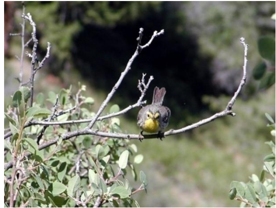
Grace's Warbler.