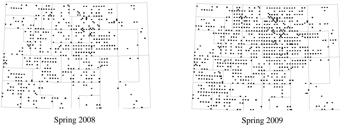
Figure 1. Comparison of COBBAIL block assignments in spring 2008 and spring 2009.

If you haven't done so already, I encourage you to begin scouting your blocks and planning your atlasing activities for the 2009 breeding season. With only 3 years left to finish fieldwork for COBBAIL, the clock is ticking to complete still over 1,800 blocks. I truly appreciate the efforts put forth by all